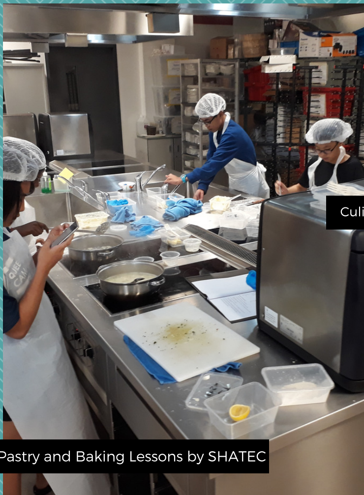
Culinary Lessons by SHATEC - Enabling Village, Sapling Kitchen