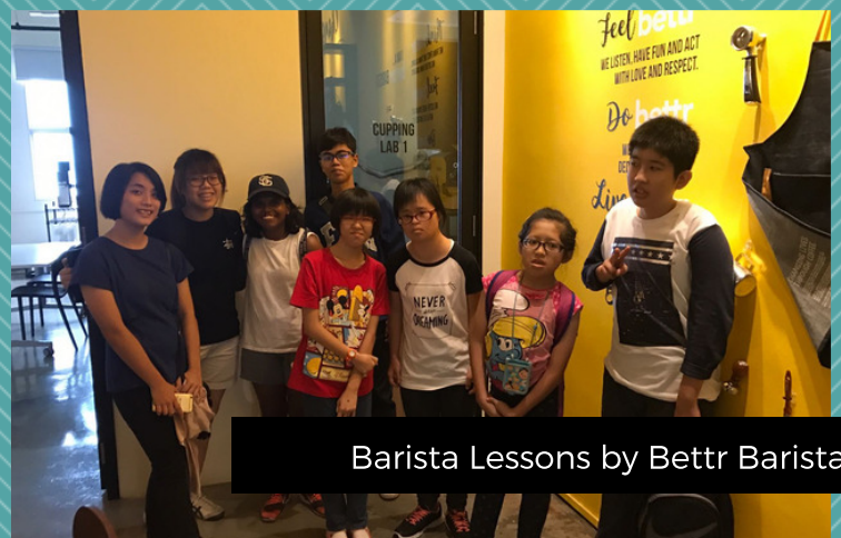
Barista Lessons by Bettr Barista