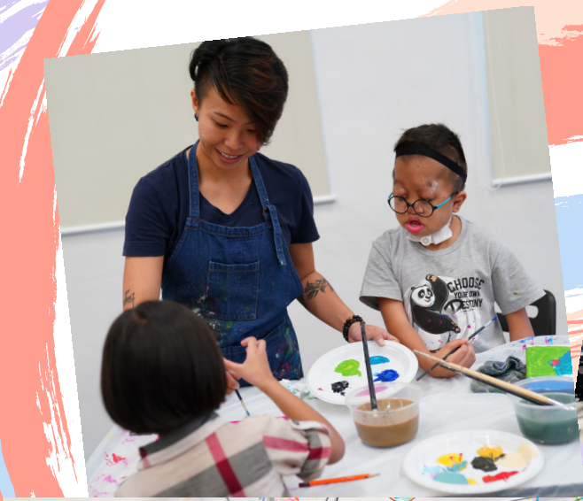
One-Line Portrait Drawing